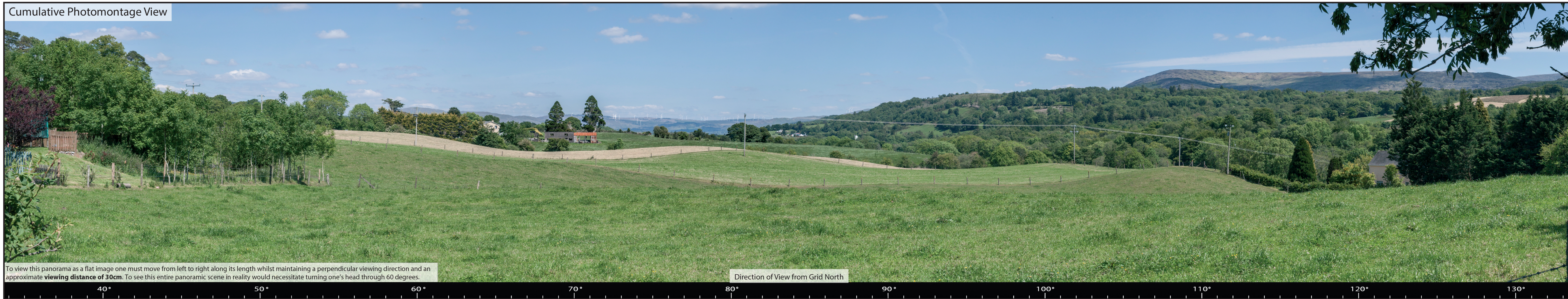
Cumulative Photomontage View

To view this panorama as a flat image one must move from left to right along its length whilst maintaining a perpendicular viewing direction and an approximate viewing distance of 30cm . To see this entire panoramic scene in reality would necessitate turning one's head through 60 degrees.